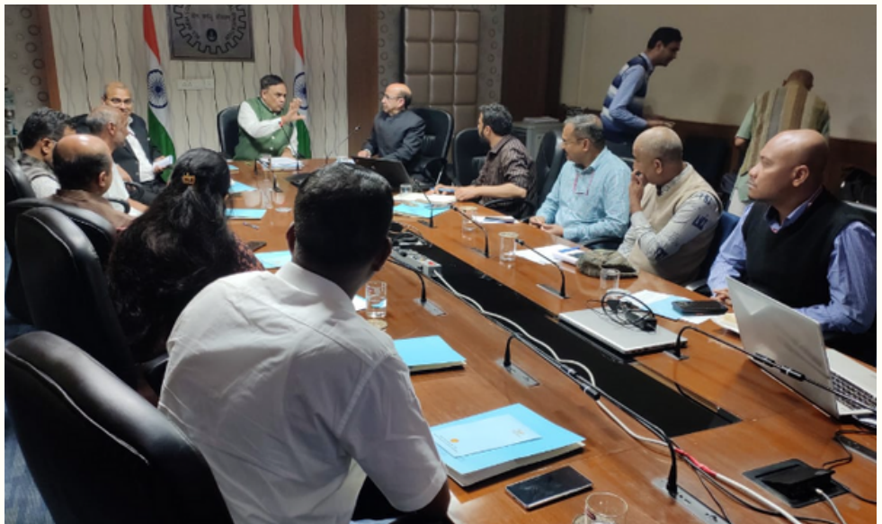
NCC-IP Meeting on 22nd February in presence of AICTE Chairman, MS, DD IPC, ROs and IPC Team

Hon'ble Chairman and Hon'ble Member Secretary had a fruitful interaction with NCC-IP members on Future Plans and Vision for Holistic Value Based Education in Technical Institutions as articulated in NEP.